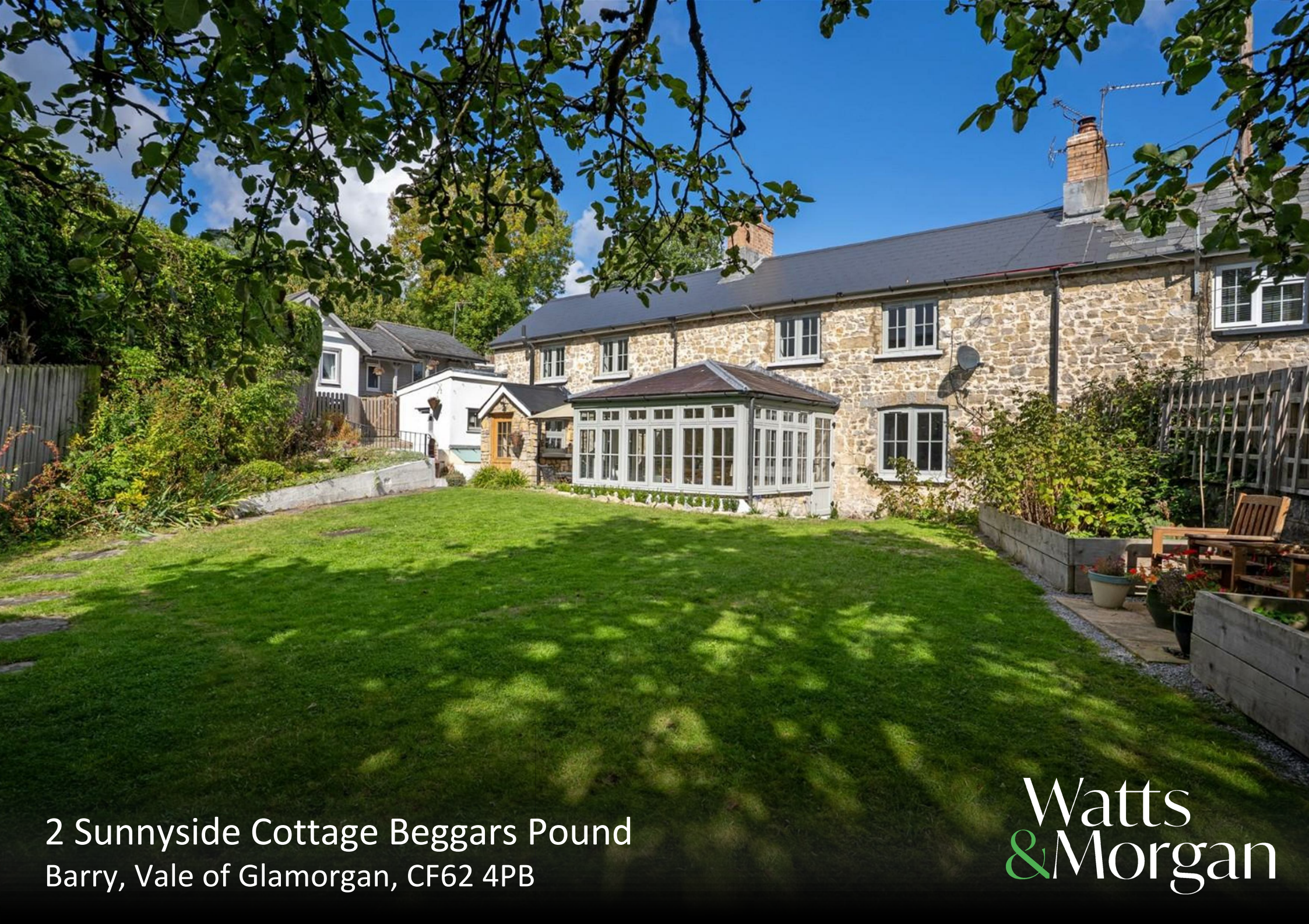
2 Sunnyside Cottage Beggars Pound Barry, Vale of Glamorgan, CF62 4PB